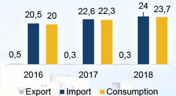
Export, Import and Consumption of Corn Starch, euro mln *