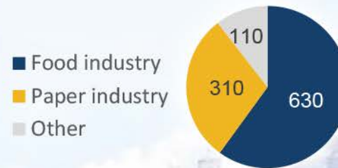
Key consumers, k tons